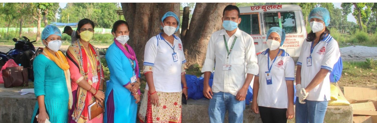
Image: The Nepal Disabled Women Association (NDWA) are one of CBM's incredible partners working to deliver vital support to people with disabilities and their families in the poorest communities in Nepal.

All Trustees give of their time freely and no Trustee received remuneration in the period. Details of Trustees' expenses and related party transactions are disclosed in note 5 to the accounts. The pay of staff is reviewed regularly and normally adjusted for increases in inflation. Salaries are also benchmarked against similar sized organisations in the local area.