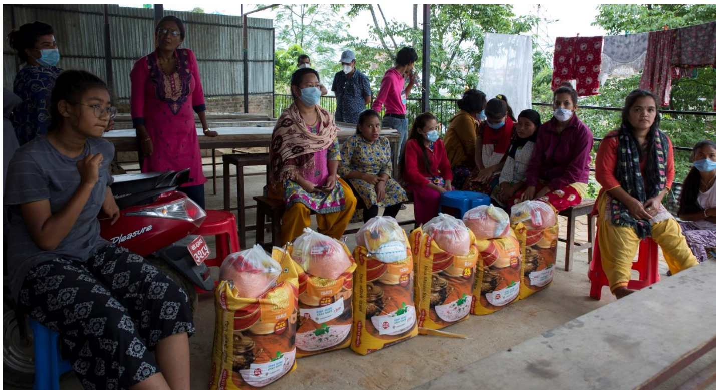
Image: Members of Entire Power in Social Action Nepal, after receiving food packages from Nepal Disabled Women Association (NDWA).

People with disabilities were already likely to be among the poorest in their communities, and the global pandemic has left them falling even further behind. Weeks of strict lockdown measures left families unable to work, with no source of income or way to buy food. Where governments provided support, this was often not accessible to people with disabilities.