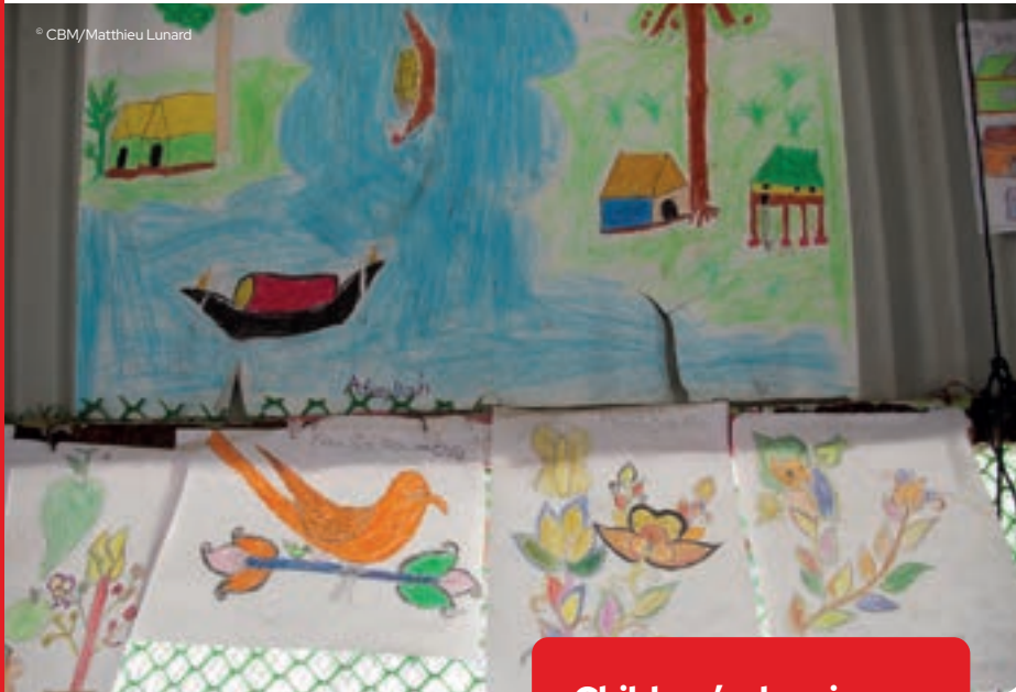
Children's drawings on the wall of a shelter at Kutupalong refugee camp, Cox's Bazar, Bangladesh.