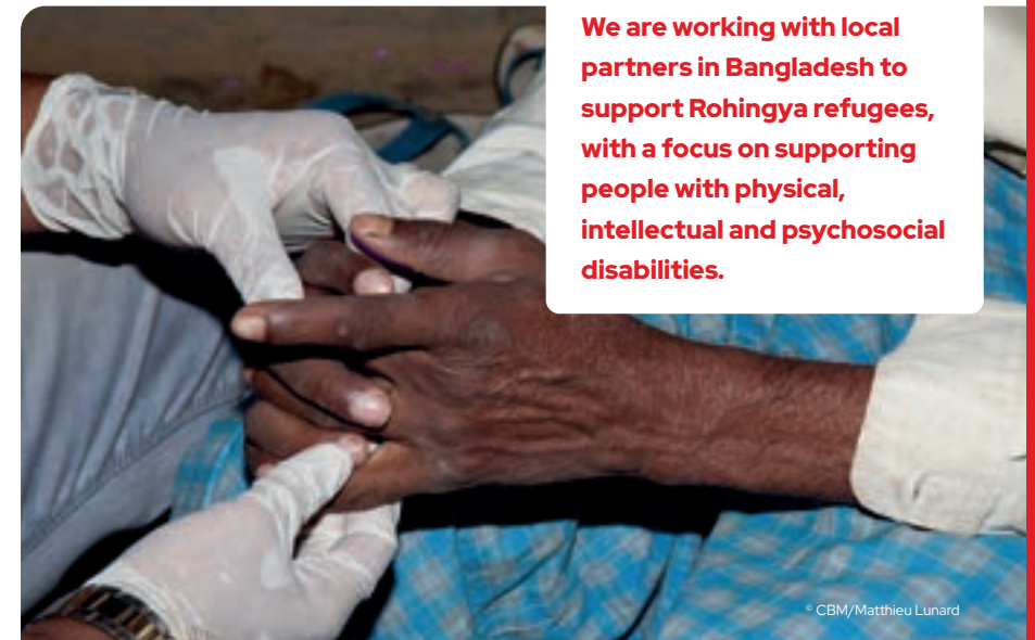
We are working with local partners in Bangladesh to support Rohingya refugees, with a focus on supporting people with physical, intellectual and psychosocial disabilities.

Lord, thank you for CBM staff who are using their expertise to train project teams at partner hospitals. We pray for protection and peace as they travel.