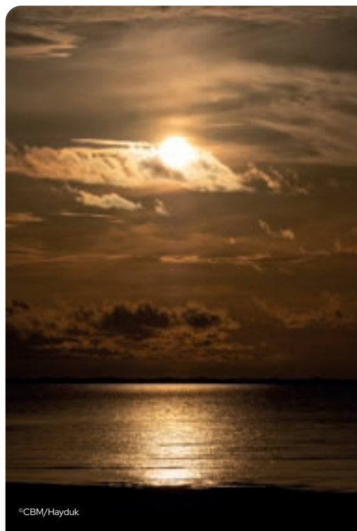
Sunrise over Lake Malawi in Nkhotakota, Malawi, Southeast Africa.

We ask that you will grant strength to people who may be waiting for sight-saving surgery or other forms of medical care, and be with them as they wait for the treatment that they need.