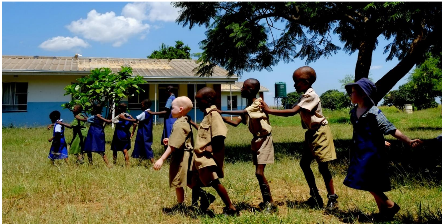
Photo: Children with visual impairments attending the CBM-supported Kadoma School in Zimbabwe, lead one another back to class after break time.

Children with disabilities are more likely to miss out on education than any other group, making up a third of all children who are not in school. Without education, children are much less likely to be able to fulfil their potential and are more likely to live in poverty as an adult. We help girls and boys with disabilities to go to school and complete their education, working in the world's poorest places to build more inclusive education systems, training teachers, equipping schools and supporting parents and communities to help children flourish.