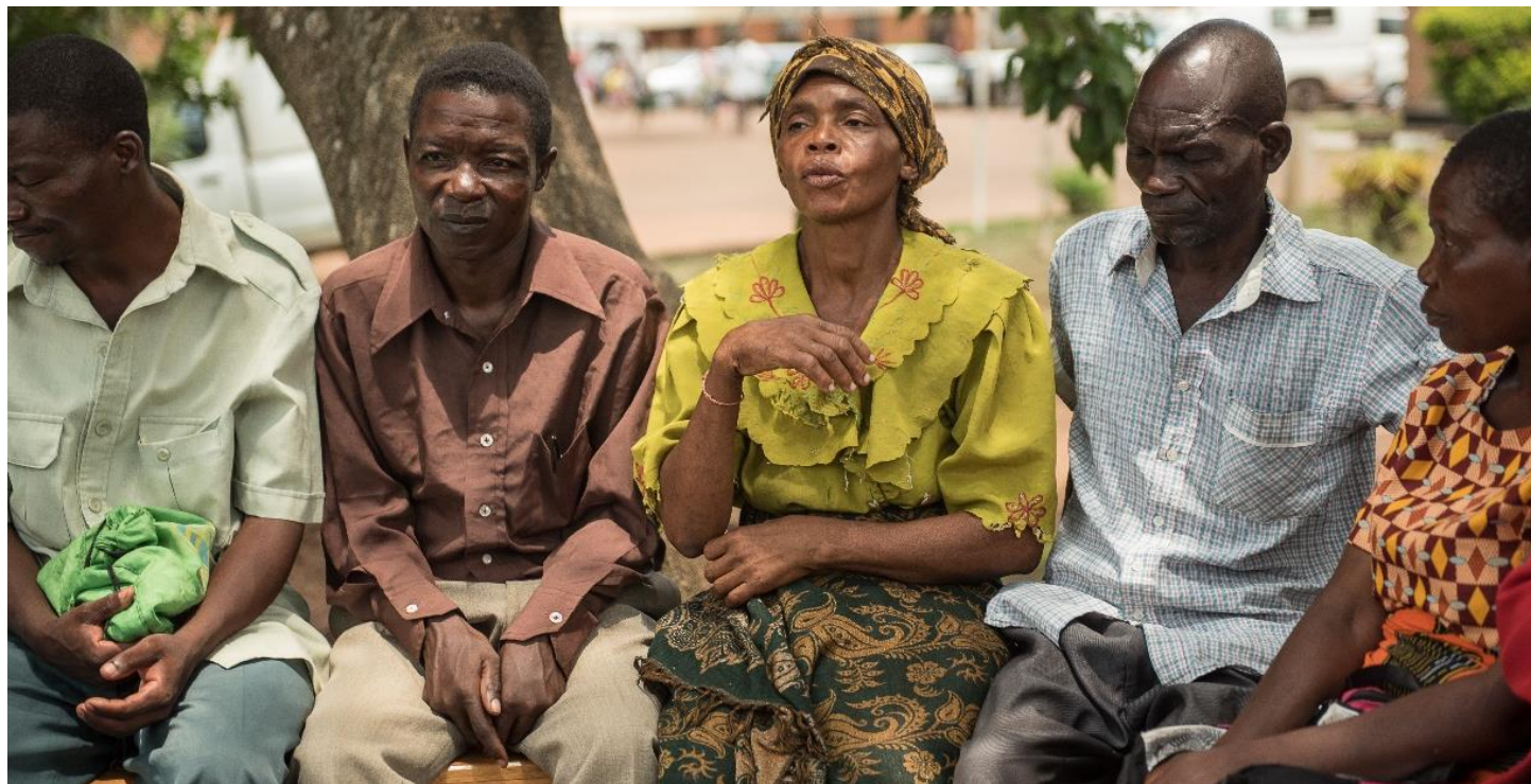
Photo: Members of a CBM-supported self-help group for people with psychosocial disabilities in Malawi, providing peer support and promoting understanding in the community.

People with disabilities often face discrimination and routinely denied access to their rights or the opportunity to fulfil their potential. Too many employers, teachers, communities, government – even international programmes – fail to take their needs into account. CBM works with people with disabilities and their families in the world's poorest places, equipping them to speak out and claim their rights and hold their governments to account, and showing communities that we all benefit when disabled people are included. Through our advocacy work in the UK and worldwide, we influence and support Governments, international bodies and mainstream NGOs to recognise the rights and contributions of people with disabilities and ensure they are included in development activity.