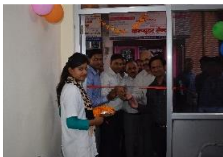
New Vision Centres open to deliver sight-saving eye health services in rural India (p.12)