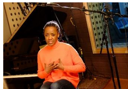
TV presenter Diane Louise Jordan heads appeal to raise funds to prevent childhood blindness (p.22)