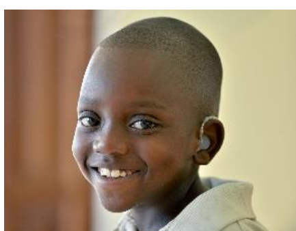
New programme launched to prevent hearing loss in Zambia (p.13)