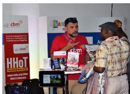
Global Disability Summit brings together world leaders, civil society and disability organisations and companies in London (p.20)