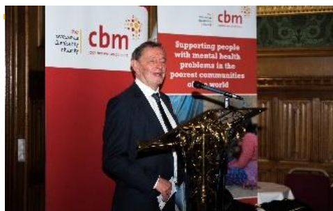
Former Home Secretary Lord Blunkett speaks out about disability and mental health at CBM event (p.13)