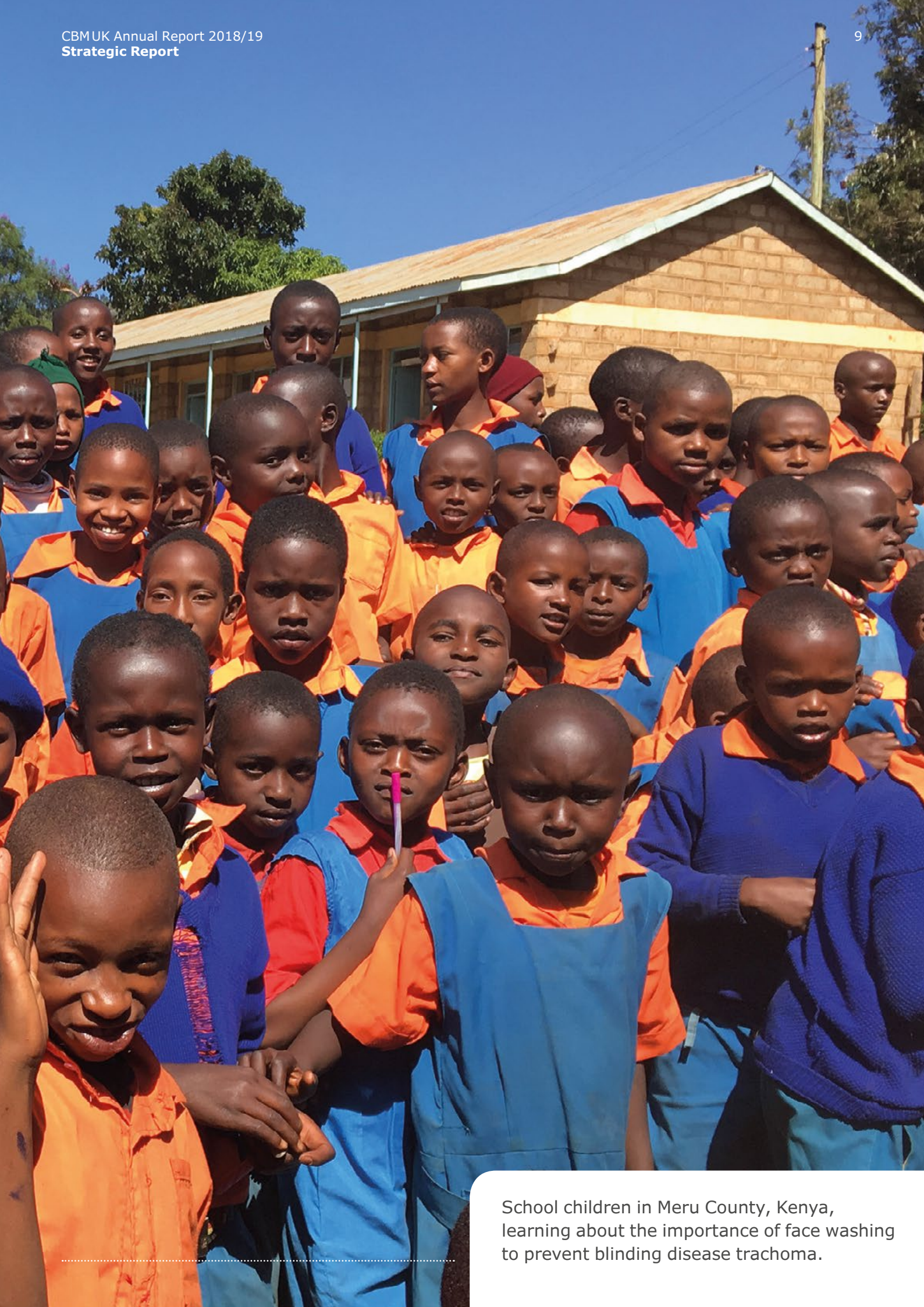
School children in Meru County, Kenya, learning about the importance of face washing to prevent blinding disease trachoma.