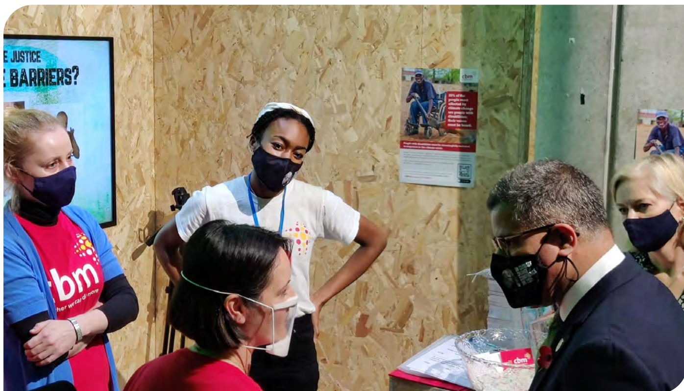
CBM UK's Ursula Grant speaking to Alok Sharma President COP 26 at CBM UK stall in the Green Zone at COP 26.

Climate-related disasters are driving increased levels of risks, vulnerability, and human rights abuses, whilst also disrupting livelihoods, increasing displacement, influencing the spread of diseases, worsening global public health and threatening lives overall. In Mozambique, Malawi and Zimbabwe, more than 1000 people lost their lives in 2019 as a result of Cyclone Idai with millions left destitute without access to foods and basic services. 27 In 2021 Madagascar featured high in the international news as the first country to ever experience a climate induced famine. 28 This growing humanitarian climate emergency requires significant investment in Disaster Risk Reduction (DRR), and humanitarian programmes that boost the resilience and adaptive capacities of vulnerable communities and at risk groups such as persons with disabilities, and ensure they receive climate adaptation funds to manage the risks they face. The participation of people affected by climate change will be critical to ensure responsive, accountable and effective DRR and humanitarian programming. Unless policy and prevention and mitigation measures are put in place, climate change will continue to be a leading driver of humanitarian need. The participation of and support to persons with disabilities and their representative organisations in all decisions affecting the enjoyment of their rights in crisis situations in equal measure to others is a precondition to ensuring climate justice. 29