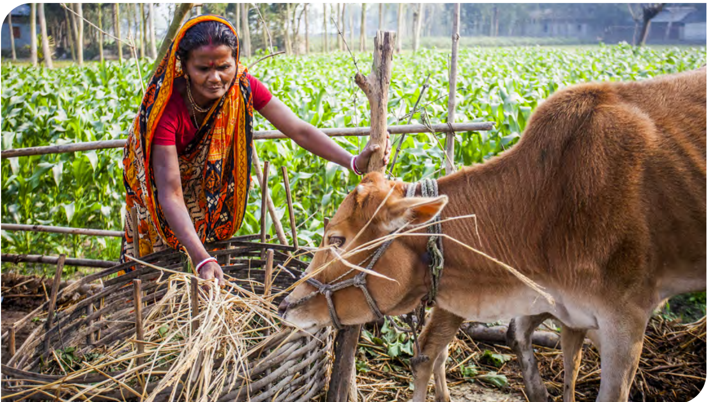
Cow Rearing in Gaibandha city Bangladesh.

In the short term, we will prioritise supporting training, confidence building and effective networking of country teams, member teams, OPD partners and climate activists using platforms for e-learning as a basis. In the longer term, in partnership with OPDs, we will utilise CBM Global emerging programmatic work to highlight good practice and solutions that can work and can be scaled up. We will continue to invest our financial and human resources into learning networks supporting OPDs to learn and grow in climate technicalities.